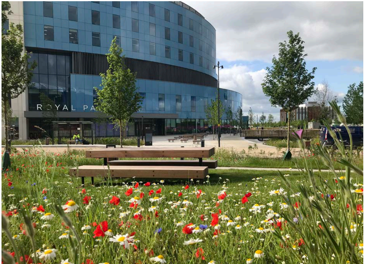
ABOVE & BELOW: CBC's The Green & The Gardens public realm by Ryan Gander, 2019.