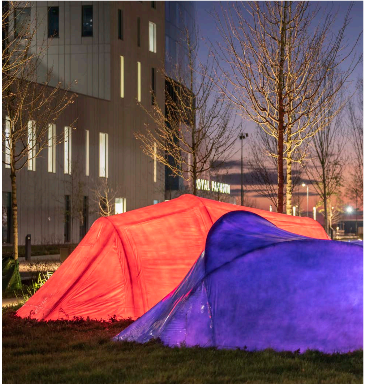
Installation photograph of The Green & The Gardens public realm by Ryan Gander, 2019