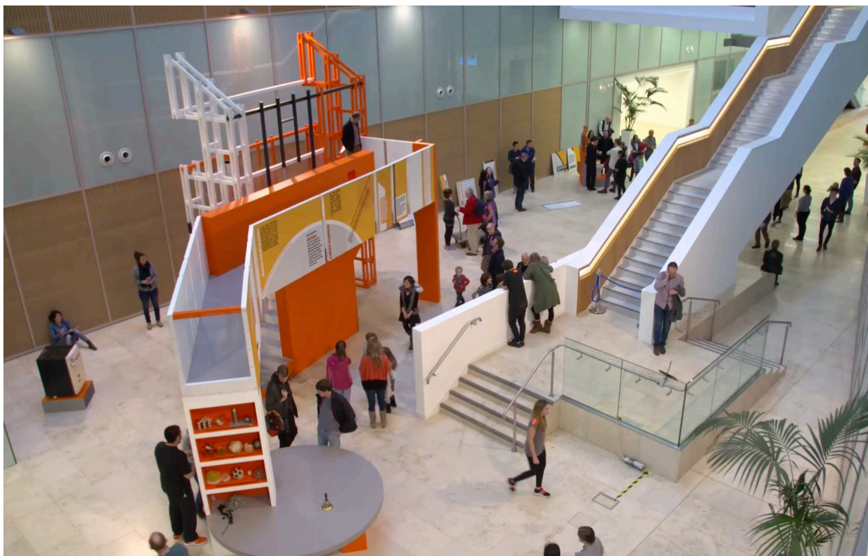
ABOVE & BELOW: Theatre company 30Bird and architectural practice PublicWorks' installation and activity as part of 'Home in the Service of Science' Artist-in-Residence at The Medical Research Council Laboratory of Molecular Biology (MRC LMB) 2017-18.